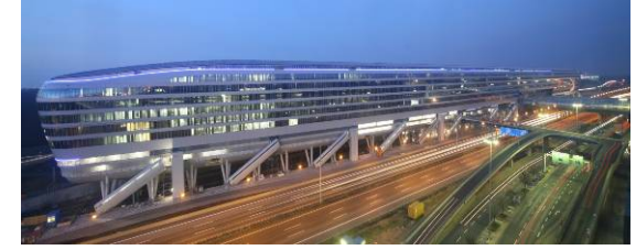
The Squire, Frankfurt