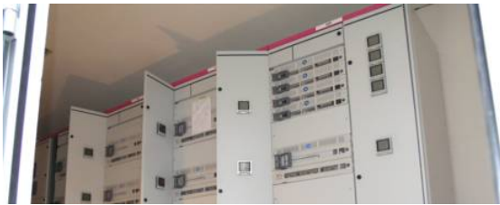
30 data processing centres in Germany