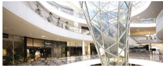
PalaisQuartier with shopping centre MyZeil, Frankfurt