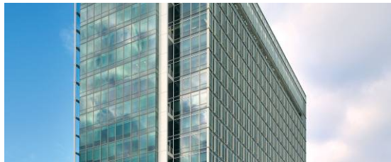
Czech Republic, City Tower, Prague