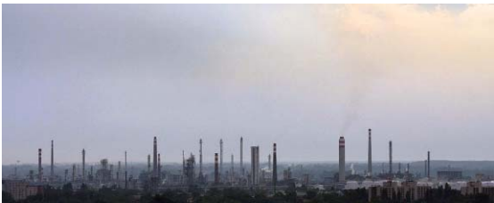
Slovakia, SlovNaft, (Petrochemical refinery), Bratislava