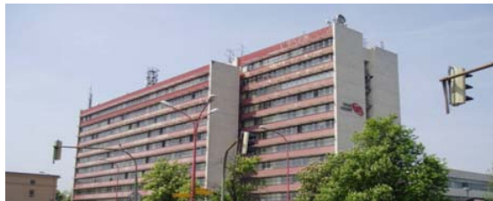
Slovakia, building at Jarošova street, Bratislava