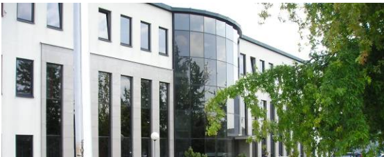
Austria, Schneider Electric, Vienna