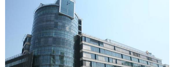
Czech Republic, Union Investment Trianon, Prague