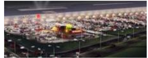
Croatia, Supernova, Zadar