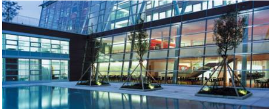
Allianz Headquarters Schwabing and Unterföhring (Munich)