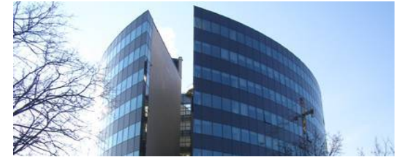
Croatia, Grand Centar Zagreb