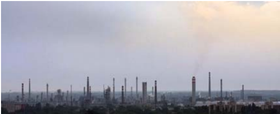
Slovakia, SlovNaft, (Petrochemical refinery), Bratislava