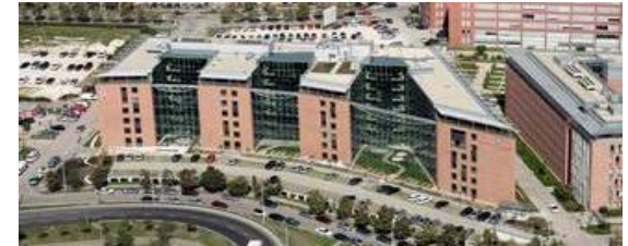
Hungary „D“ Building IVG, Budapest