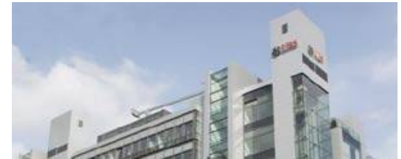
Skylight office and administration building, Frankfurt