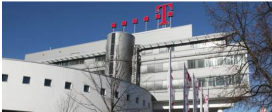
Deutsche Telekom AG Sample of 250 properties across Germany