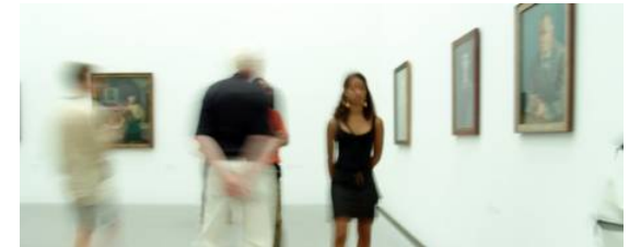
Bayerische Staatsgemäldesammlung, Munich