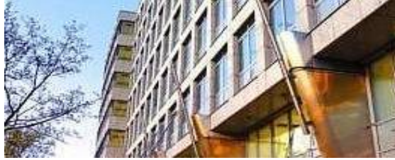
Poland, SalzburgCenter (SEB), Warsaw