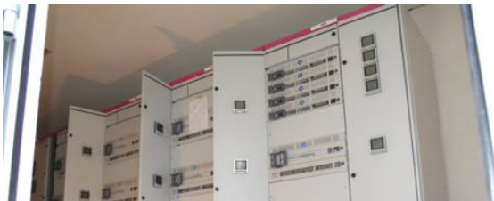
30 data processing centres in Germany