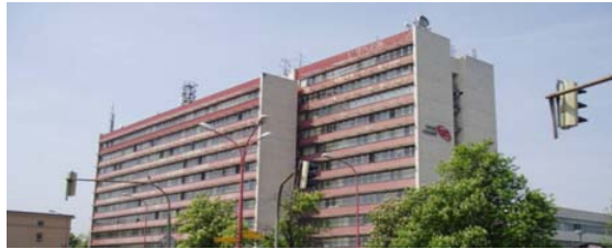
Slovakia, building at Jarošova street, Bratislava