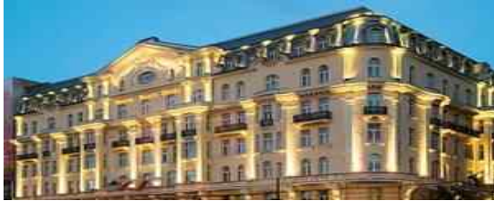
Poland, Hotel Polonia Palace, Warsaw