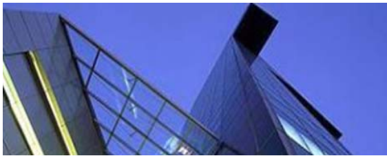
Austria, IZD-Tower, Vienna