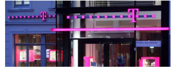
More than 600 T-Punkt shops in Germany