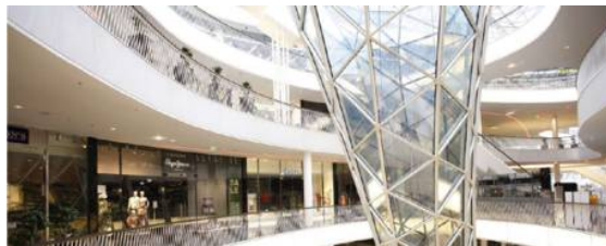
Shopping Centre MyZeil, Frankfurt