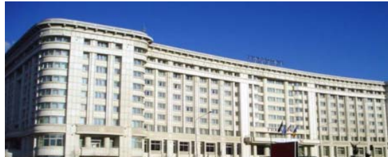
Romania, JW Marriott Grand Hotel Bucharest