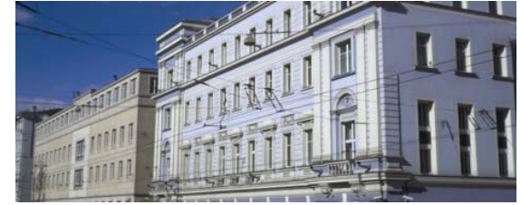
Russia, Business Center Forum 2, Moscow