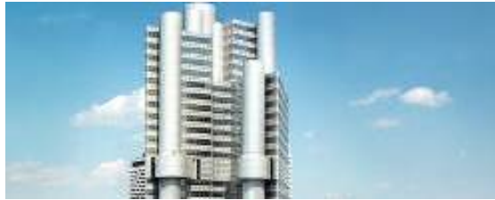
HVB Tower, Munich